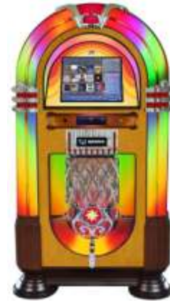
MusicGiants Store featured in a Nostalgic Jukebox

See Qsonix, Booth #GL5 Grand Lobby ICES 2008